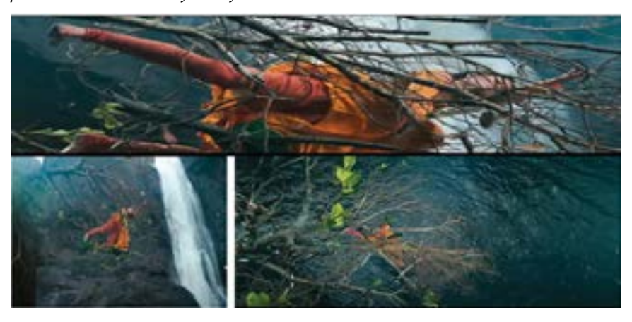
Ragini falling from tree, effect of slow motion and low to high and high to low angle shots

Ragini and Dev conversation in train- when Dev questions her integrity, the background light becomes dark, suggesting the negative side of a positively depicted character in the form of Dev.