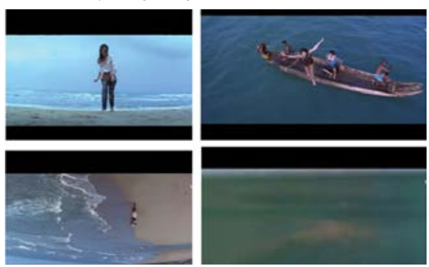
Mix angle-shots of sea in Anjana Anjani song in 'Yuva'

Song: dedicated to elongated sea side, beaches and water shots with mix angles, creating an impression of high energy rhythm while drawing parallel to the contextual frame of the song, in Yuva.